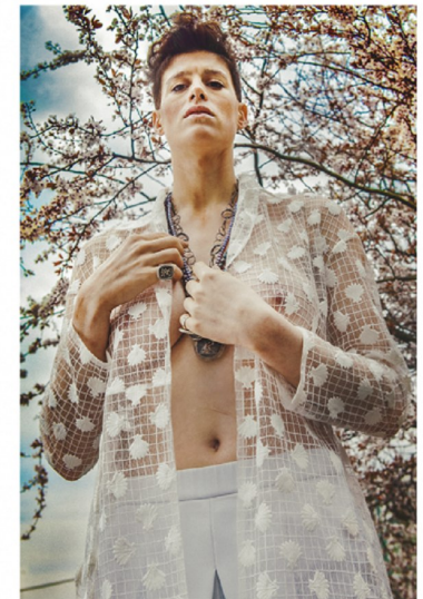
Jacket: stylists own | Trousers: Perseverance All jewellery: Pyrrha