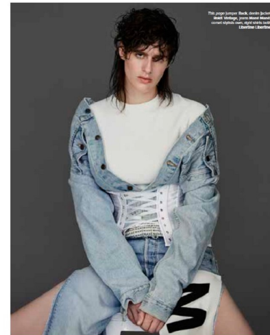
The young designer Rain, who's taken the fashion world by storm, is a transgender model, and a fierce activist. He's the new face of LGBTQ+ fashion.