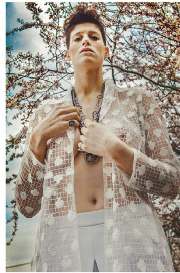
Jacket: stylist's own | Trousers: Perseverance All jewellery: Pyrrha

HEIGHT 6'2" BUST 34" D WAIST 28" HIPS 39" SHOE 7 UK HAIR BROWN EYES BROWN