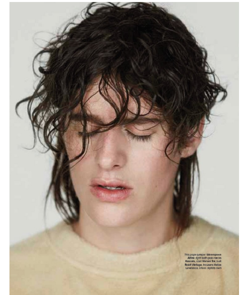
The young designer Rain, who's taken the fashion world by storm, is a transgender model, and a fierce activist. He's the new face of LGBTQ+ fashion.